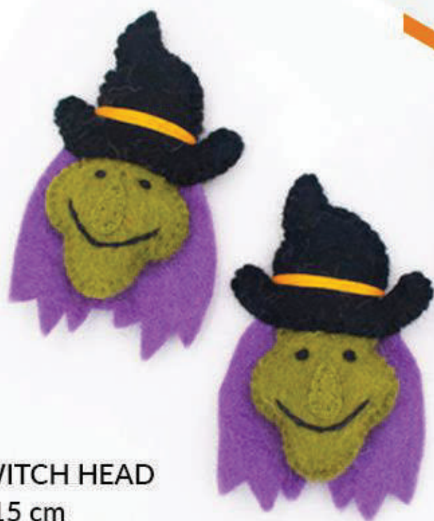
STITCHED WITCH HEAD