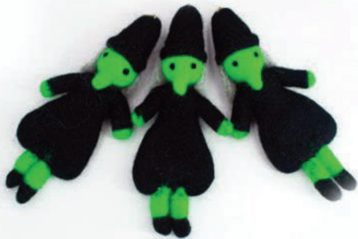
WITCH WITH BLACK HAT