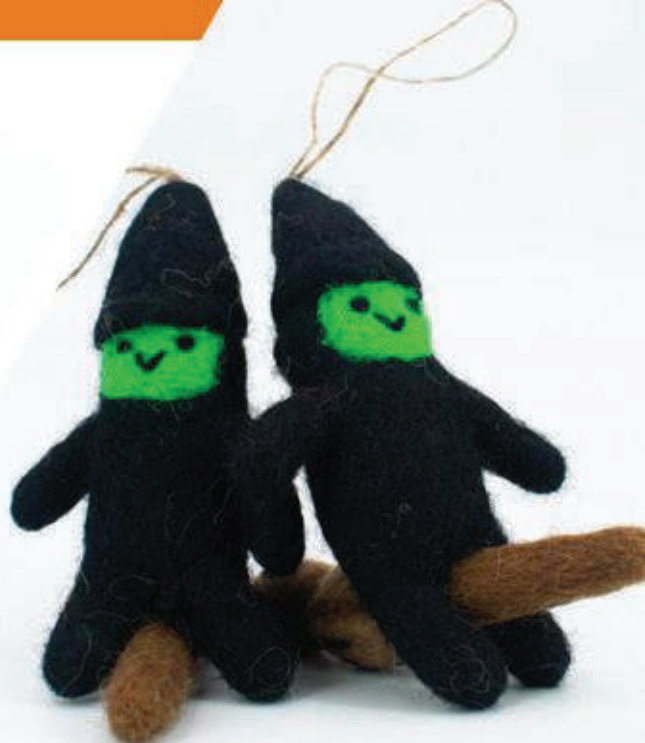
WITCH WITH BROOM