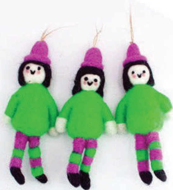
BRIGHT TRAINEE WITCH